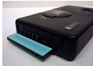
PC Card adopted for recording media