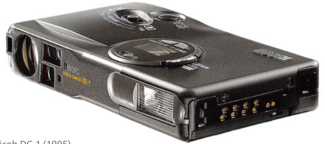
Ricoh DC-1 (1995)

Ricoh DC-1, which employed Ricoh's proprietary image processing technology that had been developed primarily for office automation systems to achieve integrated processing of image and non-image data, pioneered a new front in the digital camera market. This pioneering model featured a handy pocket-size body that housed a set of then leading-edge functions (that have now become standard) such as zoom, data communication, and video recording with sound. Also, to offer the option of data transfer to PCs, necessary applications and image recording media were developed to specifically serve the purpose of this model.